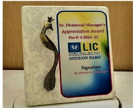
Sr.Divisional Manager Appreciation Award Photo No.15