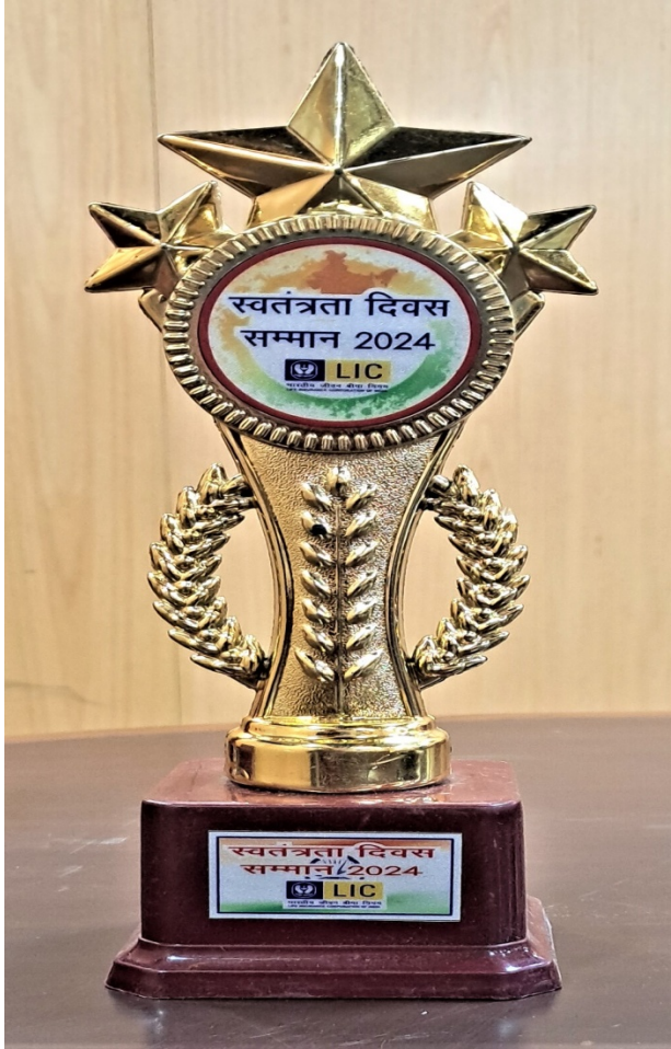
स्वतंत्रता दिवस सम्मान ट्रॉफी